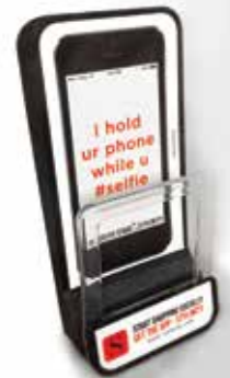
The Selfie Stage by Stylinity Available via the Stylinity app, Stylinity.com