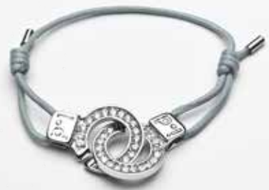
CZ Handcuff Bracelet $75 , IdYourLove.com