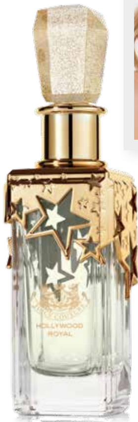
Hollywood Royal by Juicy Couture $72 , Macys.com