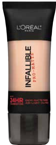
Infallible Pro Matte Foundation $12 , LorealParisUsa.com