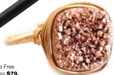
Rose Gold Druzu Ring $46 , Vitrine.Etsy.com