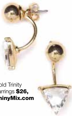
Gold Trinity Earrings $26 , ShinyMix.com