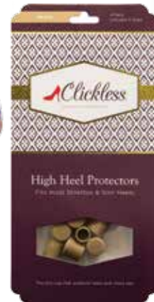
Heel Protector $12 , BeClickless.com