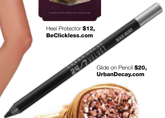
Glide on Pencil $20 , UrbanDecay.com