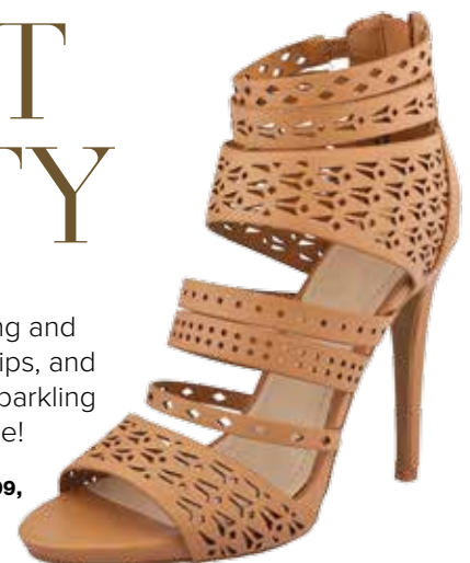
Bigalow Cutout Sandal $34.99 , ShopPrimadonna.com

True beauty emanates from within. Spring is in full swing and it's time for you to bloom. With a flirty dress, soft glossy lips, and signature winged eye, accessorized with your favorite sparkling bracelet, you look fab. It's time for a #Spring #Selfie!